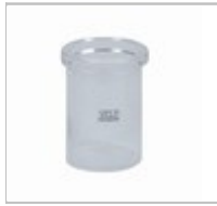
3 Extractions cups