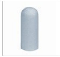
Extraction thimbles 33 x 80 ml, 25 pcs/box