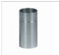
Thimble weighing cup