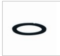
3 Viton seals