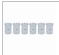
Extraction cup, 6 pcs/box