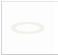
3 Butyl seals